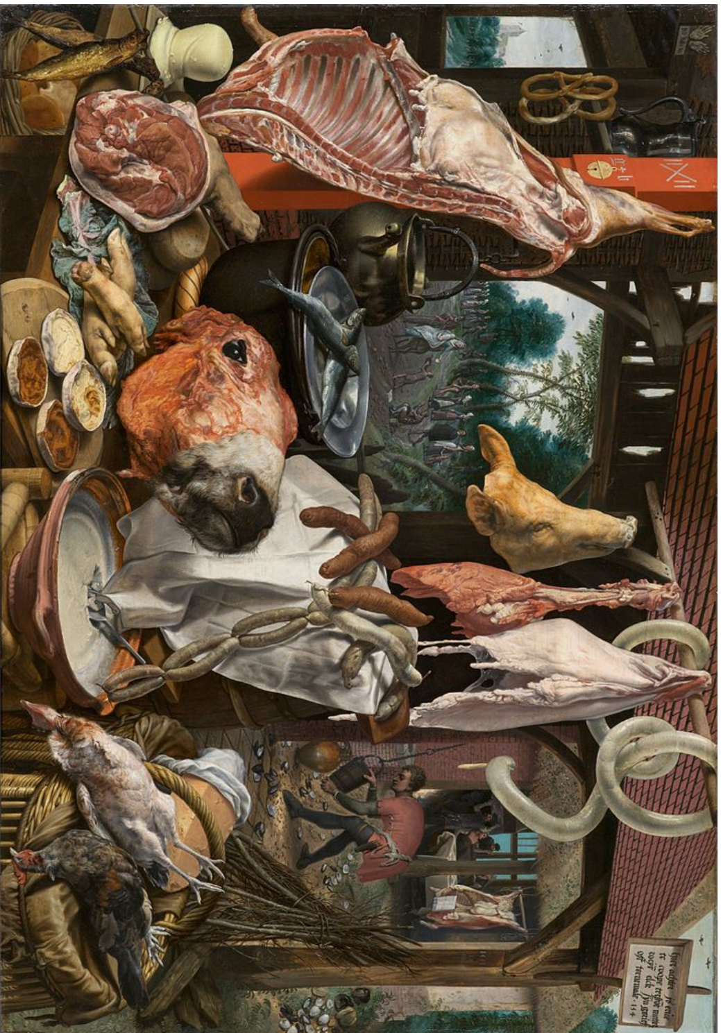
A Meat Stall with the Holy Family Giving Alms , Pieter Aertsen, 1551