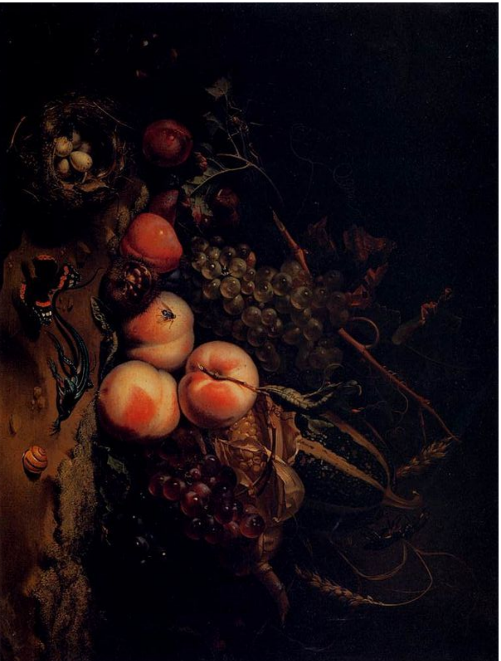
Rachel Ruysch, 1711, Uffizi Gallery in Florence, Italy, Oil on Wood