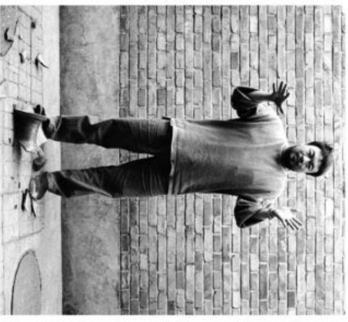
Ai Weiwei – Dropping a Han Dynasty Urn, 1995