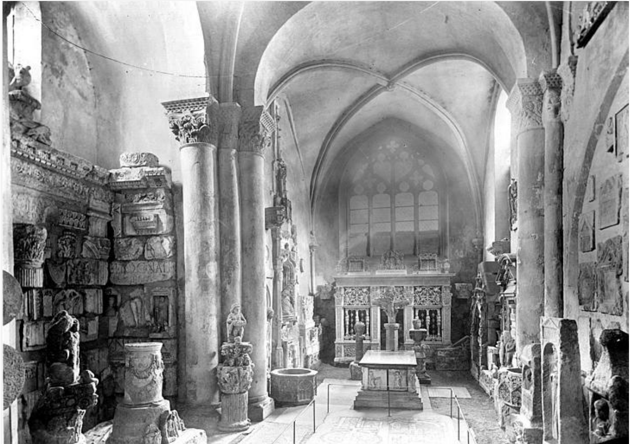
Figure 11. Nave, Church of Saint-Didier, Langres, location of the medieval tomb of Bishop Didier of Langres. Now the Musée d'Art et d'Histoire de Langres.

Archéologique de Langres. Given this, it is surprising that this honorific to the city of Langres was not included in the donation, when one realizes that the museum itself was born out of the deconsecrated space of a Romanesque church where the medieval tomb of Didier was located and where its remnants remain.[61] This chapel, adjacent to the city's cathedral, was transformed into the repository of Langres' lapidary history in 1838 (Figure 11).[62]