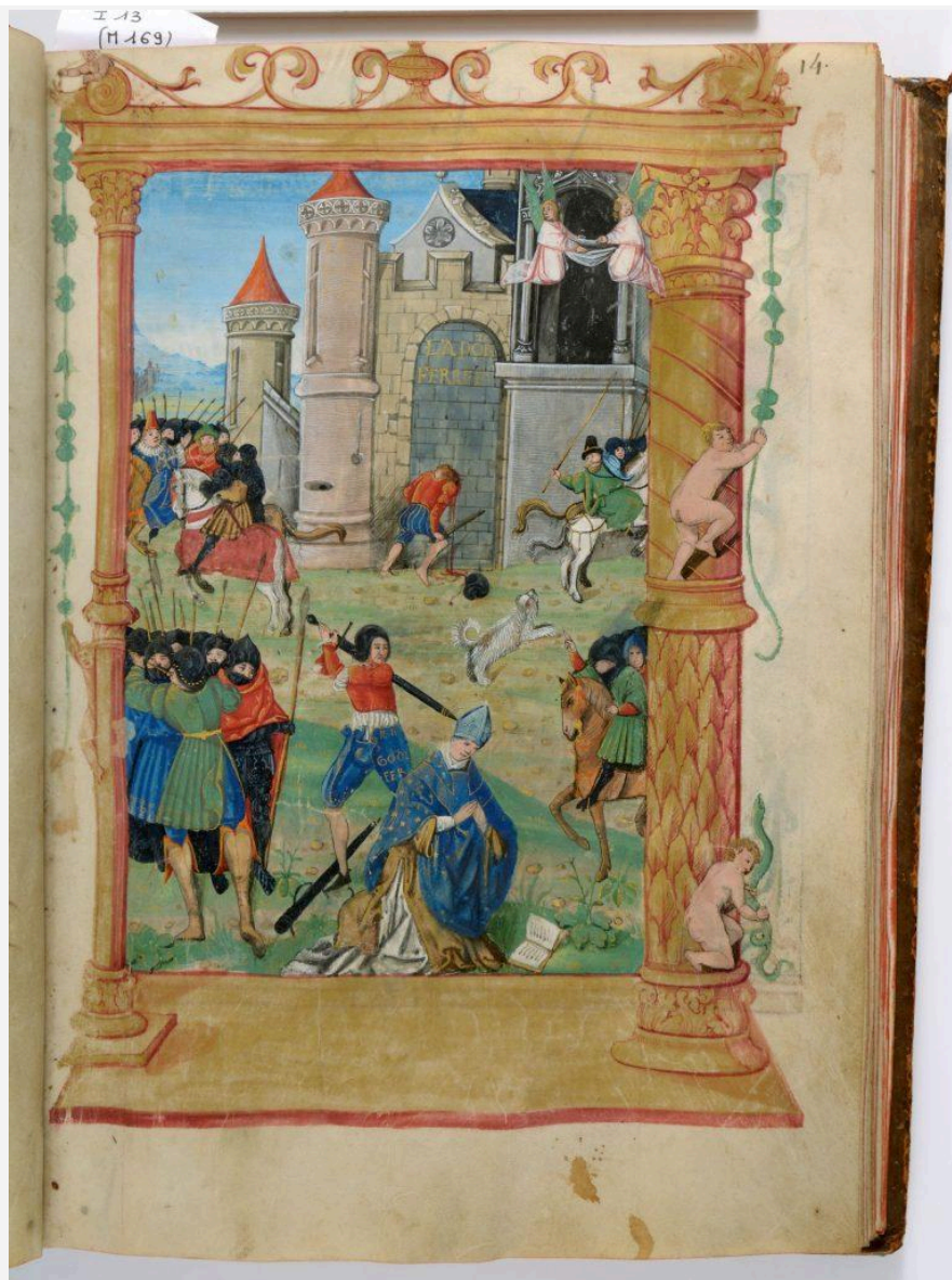
Figure 10. Martyrdom of Bishop Didier of Langres. Langres, Musée de Langres, MS 169: Registre de la Confrérie de Saint-Didier , fol. 14r. Early sixteenth century. Dépôt Société Historique et Archéologique de Langres au Musée de Langres (SHAL), cl. S. Riandet. Digital image courtesy of SHAL.

The Registre de la Confrérie de Saint-Didier was begun in the early sixteenth century and includes a miniature depicting Didier's martyrdom. In a manuscript known as Langres, Musée d'Art et d'Histoire, Manuscript 169, fol. 14r, this miniature is divided into two scenes demarcated by the decorative details on the architectural column (Figure 10).[50]