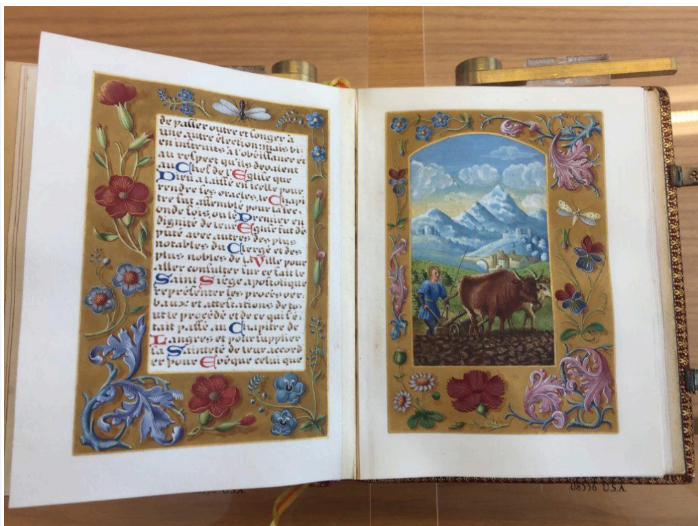
Figure 2. Didier with oxen as ploughman, fols. 4v–5r. Life of Saint Didier, Gothic Revival Manuscript, 1902. Karen Gould Collection #51, Gift of Lewis Gould. Spencer Art Reference Library, The Nelson-Atkins Museum of Art.

luminous—perhaps because of the lead white underlay—and the vivid colors engage the viewer with their vitality. Minute brushstrokes show exquisite details, such as the ribbing of flower petals, the delicate wings of flies, and individual blades of grass, demonstrating Royer’s fine, artistic skill. The decorated borders (probably from shell gold) are ornamented with flowers, fruits, insects, and acanthus leaves, reminiscent of the Hastings Hours, a late fifteenth-century book of hours (London, British Library, Additional MS 54782). Decorative multi-line initials, formed with acanthus leaves that are alternately gold on a navy blue background or navy blue on a robin’s egg blue background, demarcate twenty-two distinct sections of the life.[10] Each sentence of the prose life is marked out by alternating red and blue one-line initials, as are the personal names. Direct speech, which is minimal, is copied in red, and the book opens with a title in red, with blue capitals and a two-line decorated initial: “La Vie Mort et Passion du Bienheureux Saint Didier de Gênes Evêque de Langres.” Decorative borders are also employed on the five folia with full-page, arched miniatures. These miniatures constitute a pictorial cycle: fol. 1v depicts an angel with a scroll announcing that Didier will be their new bishop (Figure 1); fol. 5r shows Didier as a smiling ploughman whose oxen refuse to move (Figure 2);