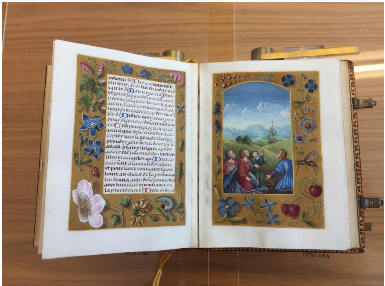
Figure 3. Miracle of Didier's flowering rod, fols. 9v–10r. Life of Saint Didier, Gothic Revival Manuscript, 1902. Karen Gould Collection #51, Gift of Lewis Gould. Spencer Art Reference Library, The Nelson-Atkins Museum of Art.

fol. 10r illustrates the miracle of the ploughman's flowering rod or verge (Figure 3);