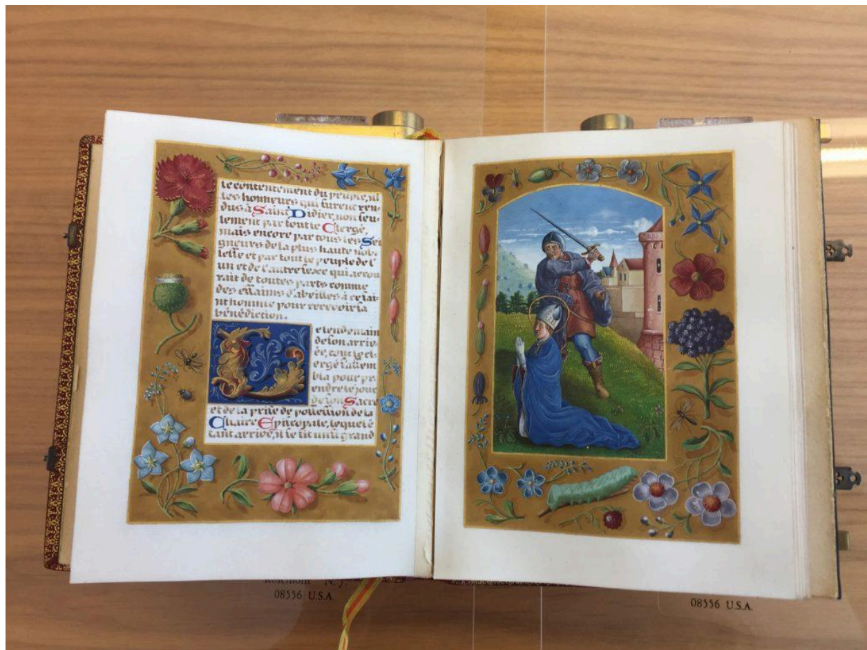
Figure 4. Execution of Bishop Didier of Langres, fols. 12v–13r. Life of Saint Didier, Gothic Revival Manuscript, 1902. Karen Gould Collection #51, Gift of Lewis Gould. Spencer Art Reference Library, The Nelson-Atkins Museum of Art.

fol. 13r portrays Didier's execution (Figure 4);