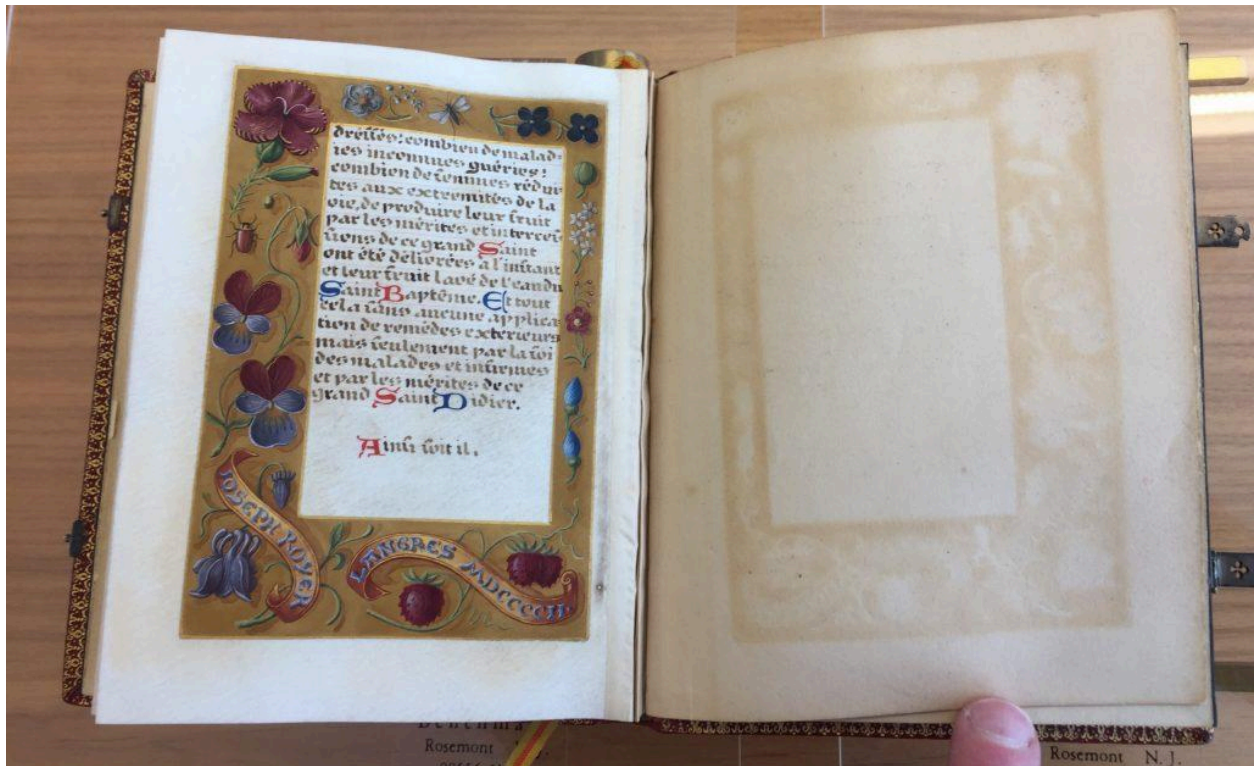
Figure 6. Ending of the Royer Didier, with scroll featuring artist’s name, city, and date: Joseph Royer, Langres MDCCCCII, fol. 21v. Life of Saint Didier, Gothic Revival Manuscript, 1902. Karen Gould Collection #51, Gift of Lewis Gould. Spencer Art Reference Library, The Nelson-Atkins Museum of Art.

The final folio features two scrolls in the lower border with the name “Joseph Royer” and “Langres MDCCCCII” (Figure 6).