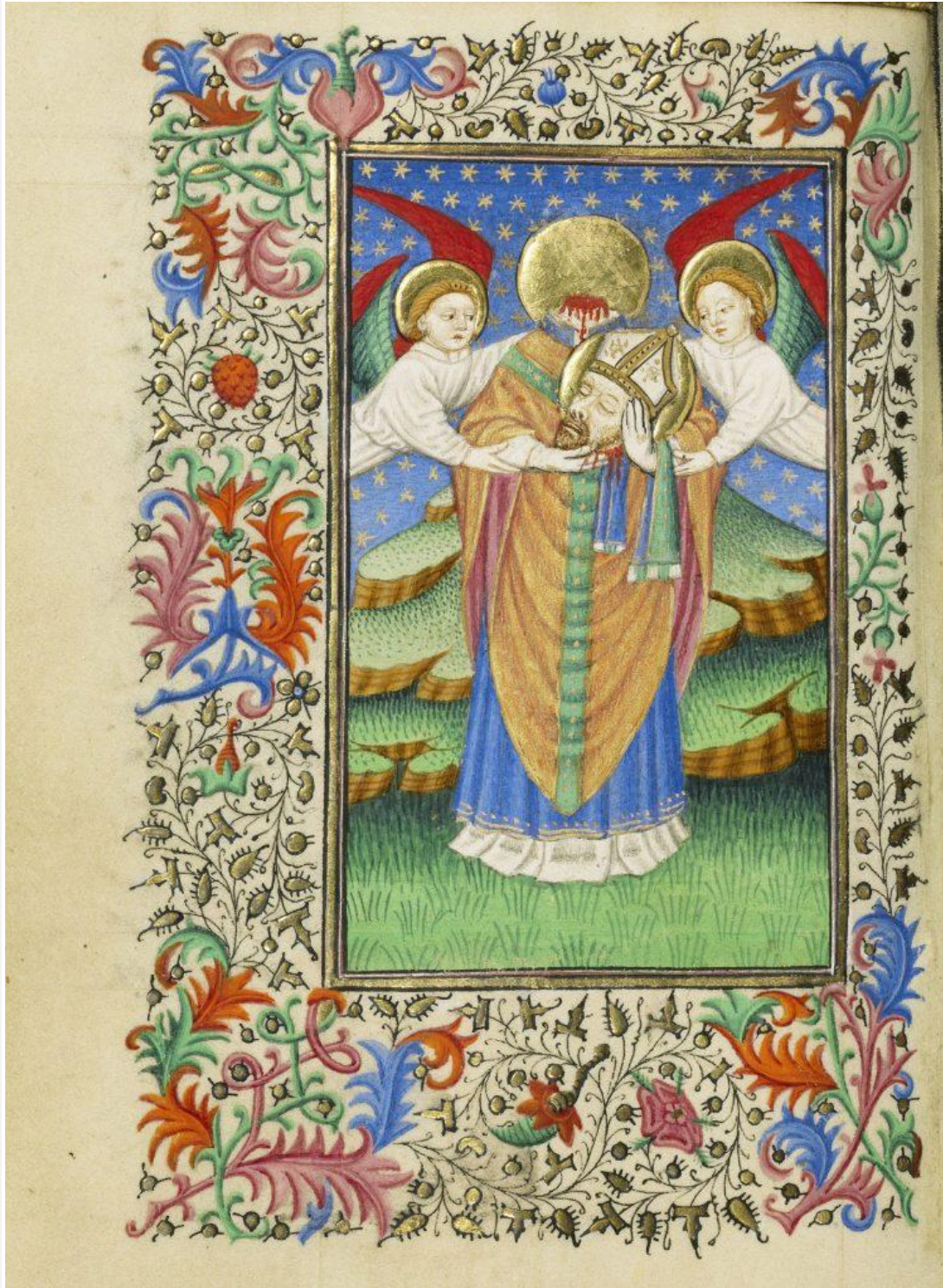
Figure 7. Denis of Paris as acephalous saint. Master of Sir John Fastolf. Book of Hours. Los Angeles, J. Paul Getty Museum, MS 5, fol. 35r. 1430–1440.

Virginia Blanton and Jack Walton, "St. Didier's Flowering Verge and the Rhetoric of Chaste Virility in a Modern Devotional: Joseph Royer's Homage to Medieval Langres," Different Visions: New Perspectives on Medieval Art 8 (2022). https://doi.org/10.61302/PMAL4500 .