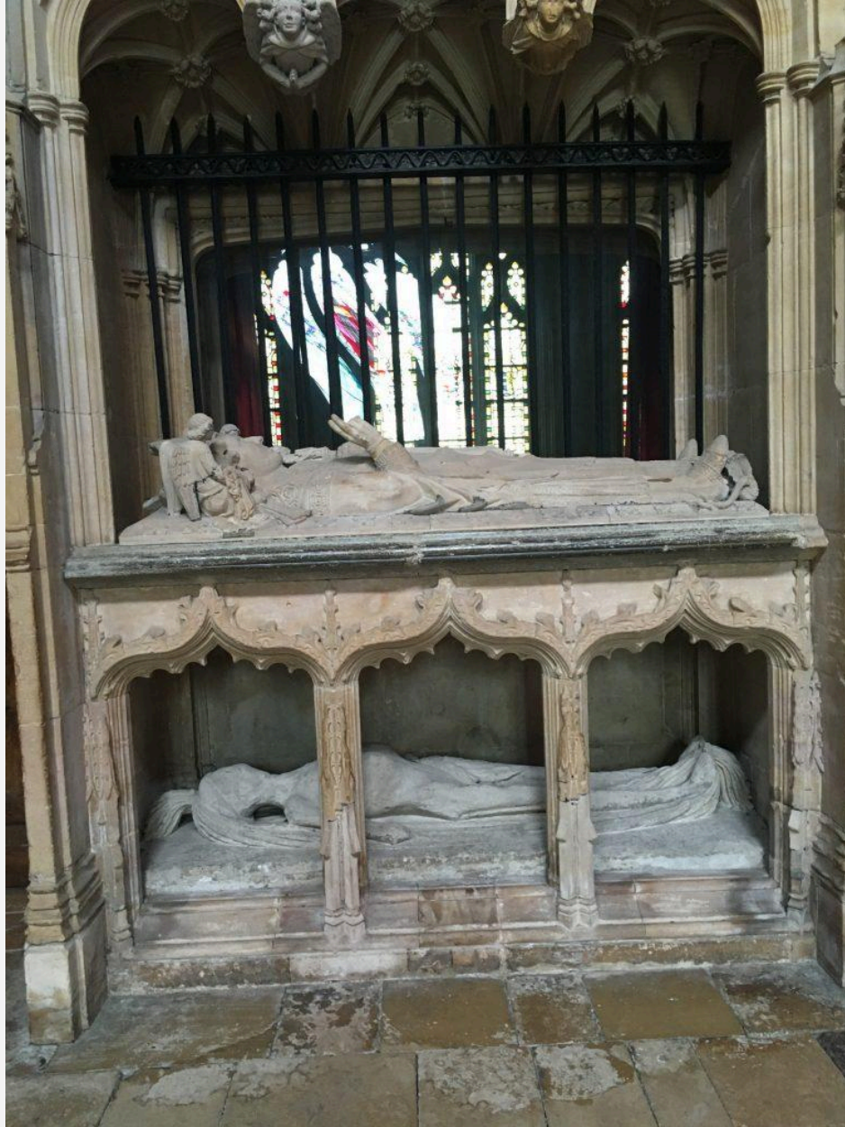
Figure 1. Tomb of Richard Fleming, Lincoln Cathedral.