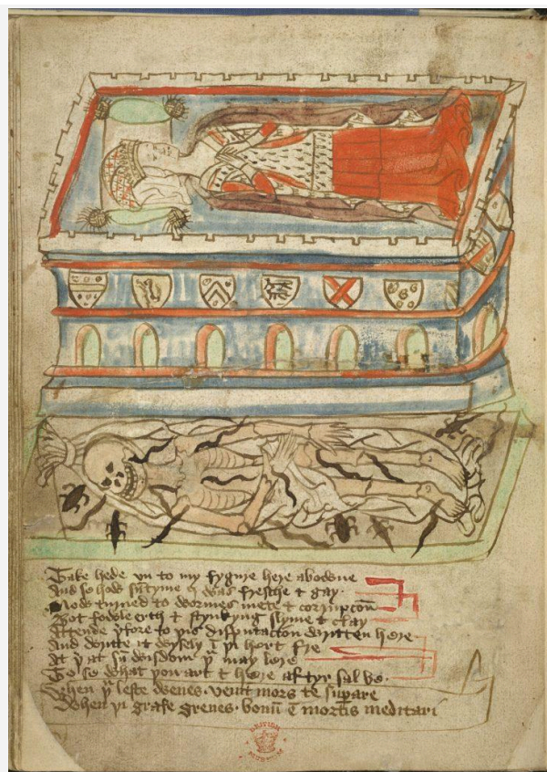
Figure 2. Effigy tomb and open grave from “A Disputation Between the Body and Worms.” Carthusian Miscellany, northern England (c. 1460-70). © British Library Board. British Library Additional MS 37049, f.

beneath it and with that to reveal the truth of death as bodily decay and dissolution, a truth that the effigy tomb sought to deny. Binski identified that sense of revelation and truth-telling in the double-decker transi tombs as well, writing that they “overcame this erasure of the body by the effigy; they performed a kind of unmasking of that which had hitherto been concealed ...revealed the skeleton in the cupboard of medieval funerary art, namely its denial of the facts of decomposition.”[33] Finally, the juxtaposition of the living and dead forms of the individual that is represented in these miniatures and created in the double-decker transi tombs is associated with truth-telling in the inscription on the tomb of the Black Prince (d. 1376). Although the tomb itself is an effigy monument, the inscription contrasts the Prince in life – “Great riches here did I possess whereof I made great nobleness. I had gold, silver, wardrobes and great treasure, horses, houses, land” – with him in death – “But now a poor caitiff am I, deep in the ground lo here I lie. My great beauty is all quite gone, my flesh is wasted to the bone. My house narrow and throng” – and then states that “nothing but truth comes from my tongue.”[34]