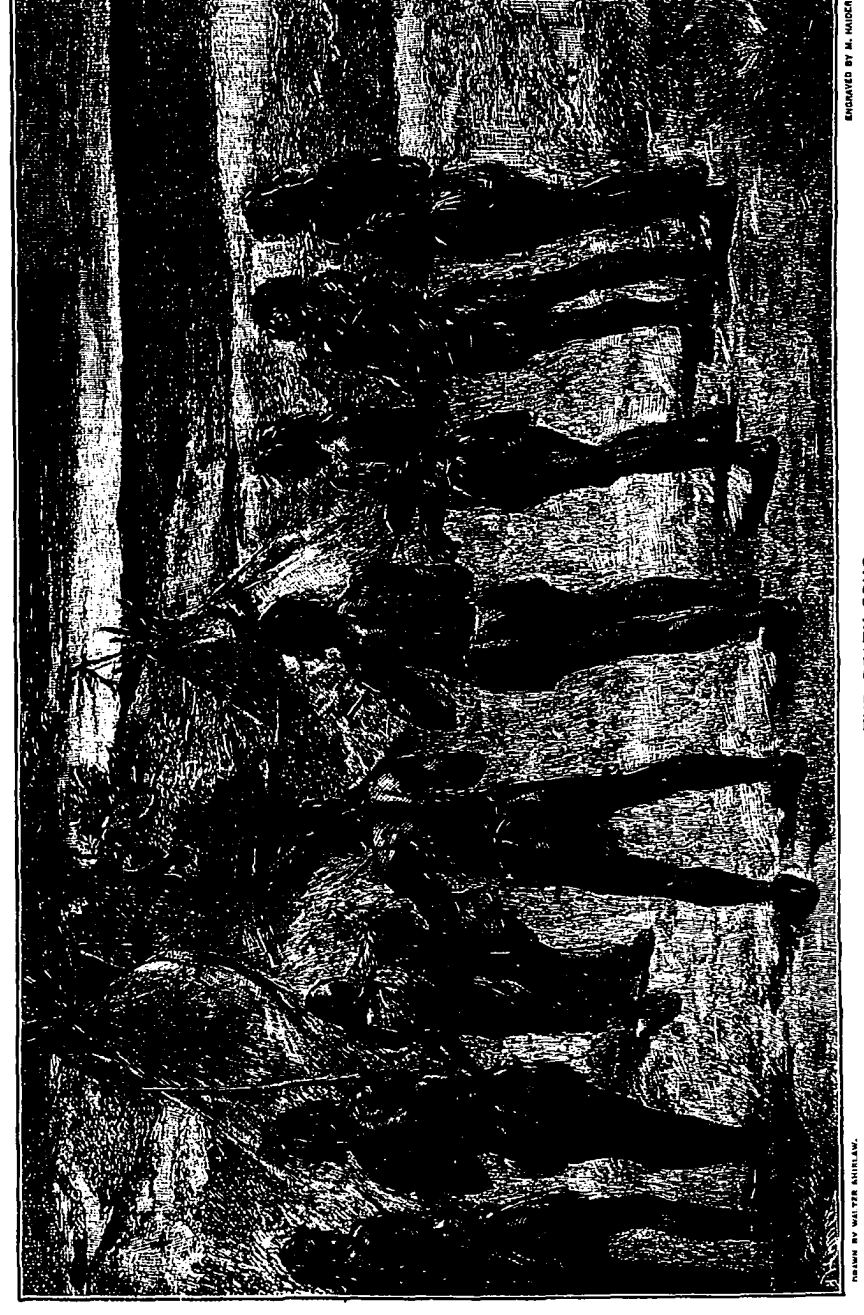
Reproduced with permission of the copyright owner. Further reproduction prohibited without permission.