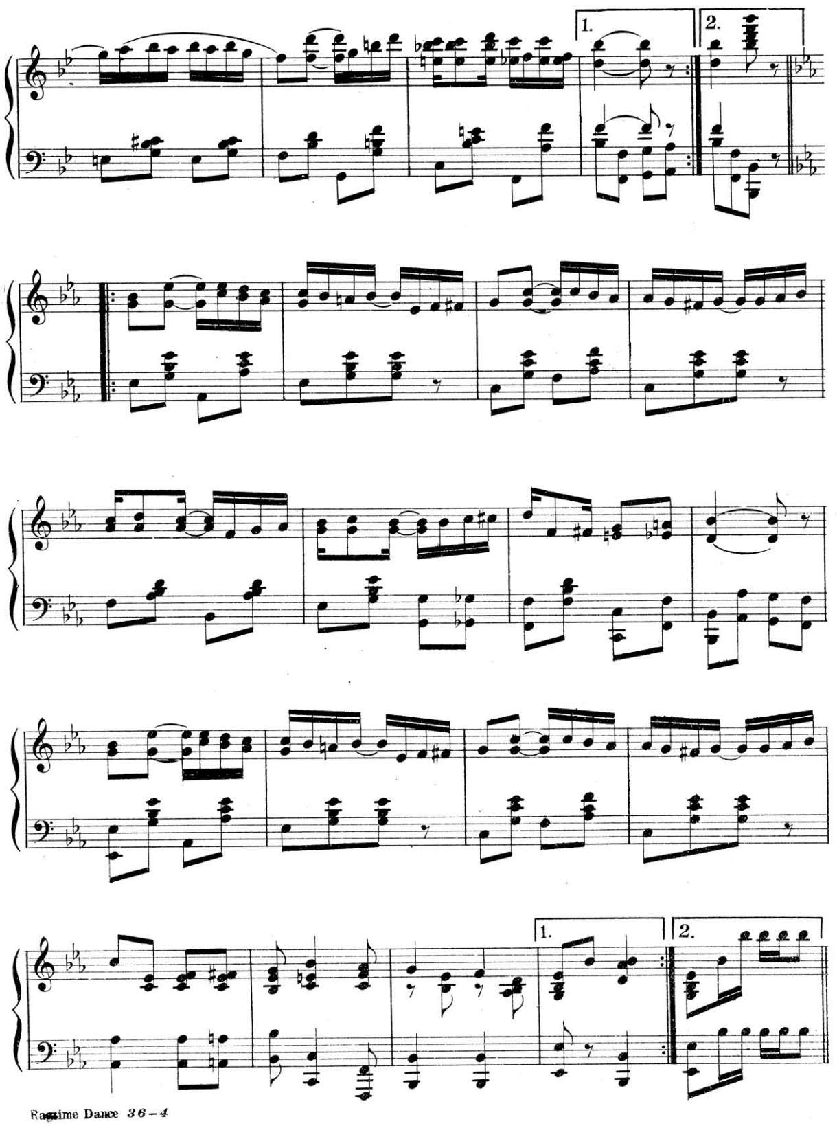
Ragtime Dance 36-4