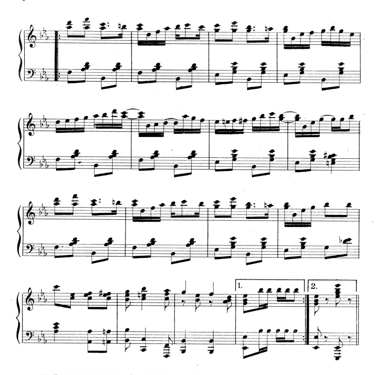
NOTICE: To get the desired effect of "Stop Time," the pianist will please \underline{\underline{Stamp}} the heel of one foot heavily upon the floor at the word "Stamp." Do not raise the toe from the floor while stamping.